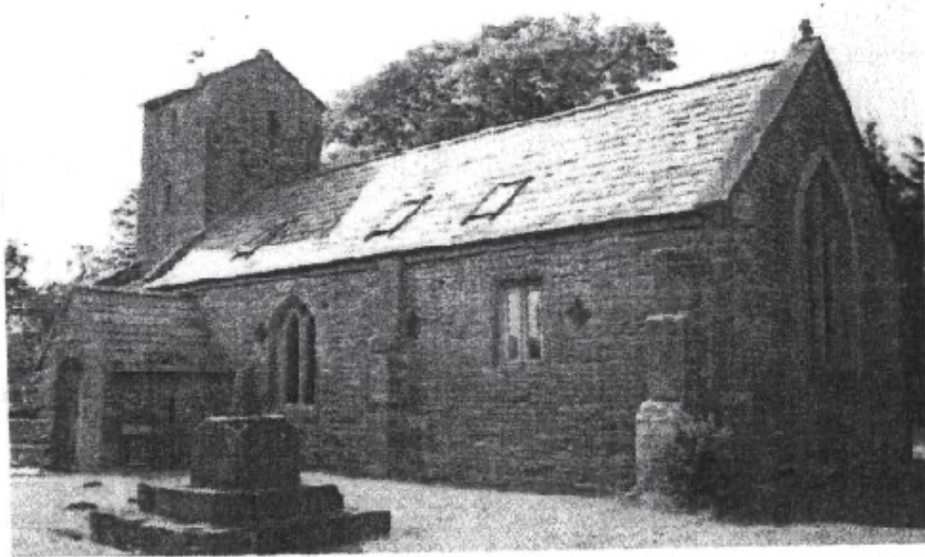
Brockhampton Church after